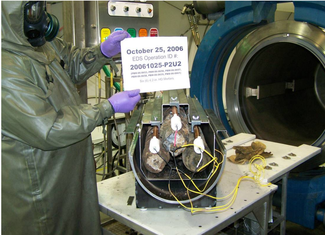
Figure 3-3. 4.2-inch Mortars